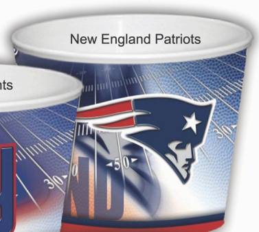
New England Patriots