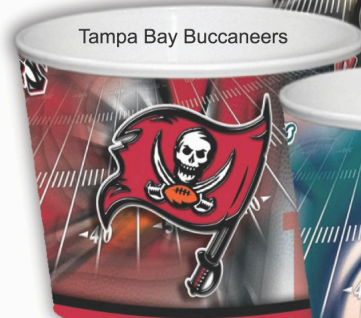
Tampa Bay Buccaneers