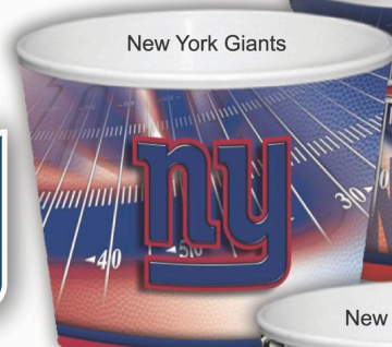
New York Giants