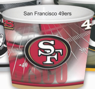
San Francisco 49ers