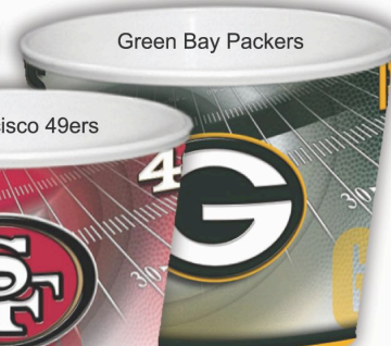
Green Bay Packers