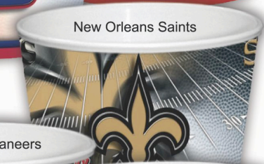
New Orleans Saints