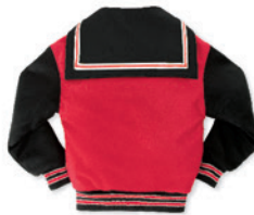
Sailor with Stripe