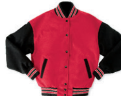
Stand Up Baseball