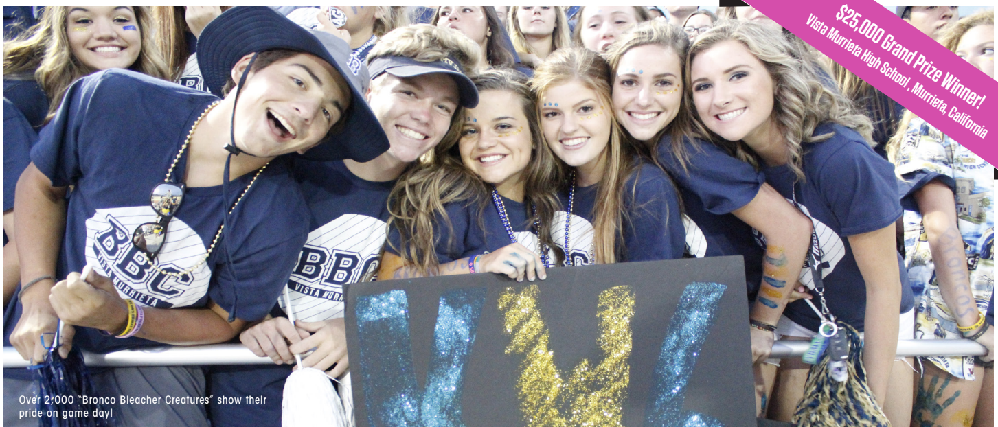
Over 2,000 "Bronco Bleacher Creatures" show their pride on game day!

**Please submit a separate nomination for each category if you are interested in being considered for more than one award.